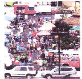
The Kankakee Farmers' Market, a Saturday gathering, has grown into a social event. The market features music, cultural events, unique foods and products.

Kankakee has a flavor all its own. From distinctive historic neighborhoods, to riverfront parks to exciting community gatherings, Kankakee is a small city with big assets.