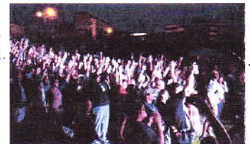
Music, culture and the arts take center stage in Kankakee. The Merchant Street MusicFest has become one of Kankakee's largest free music festivals.

City of Kankakee Home Buyer Incentive Programs